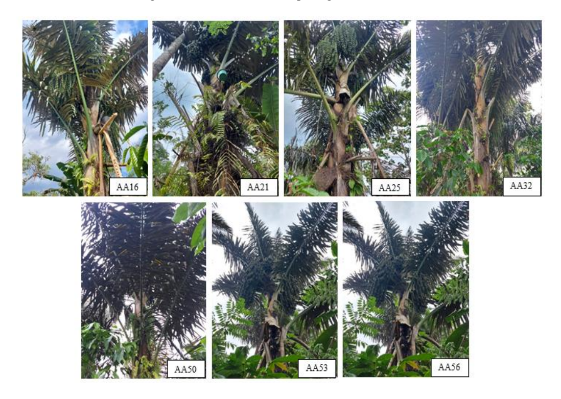
Figure 2. The figure of plants that fulfill the 11 criteria as aren plus tree in Air Abang Village

82.2% [8], the total number of aren seedlings produced will be 98,464. The quantity is adequate to plant roughly 345 hectares of land in a mono-crop arrangement, with a 6m \times 6m plant spacing.