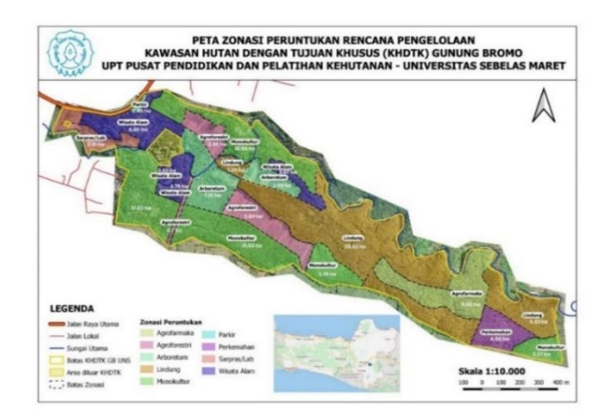
Figure 1. Zoning map for the management plan of forest areas with special purposes Mount Bromo

The research was carried out in March-November 2022. The research was carried out in forest areas with the special purposes Mount Bromo. The forest areas with special purposes area of Mount Bromo is geographically located between 7°34'21.93"–7°35'38.9" South Latitude and -110°59'40.39"–111°0'49.36". East Longitude and administratively is located in two sub-districts, namely Delangan and Gedong Villages, Karanganyar District, Karanganyar Regency, Central Java. While Administrative forestry is included in the area Forest Management Unit Office of North Lawu, Surakarta Forest Management Unit, and Central Java Company History. The forest area of forest areas with special purposes is 126,291 ha. The zoning map for forest areas with special purposes Mount Bromo is shown in Figure 1.