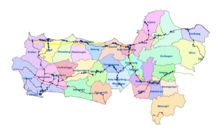
Figure 1. Regencies around the toll road area in Central Java Province

section), and the Chow, Hausman, and Lagrange multiplier tests carried out the determination.